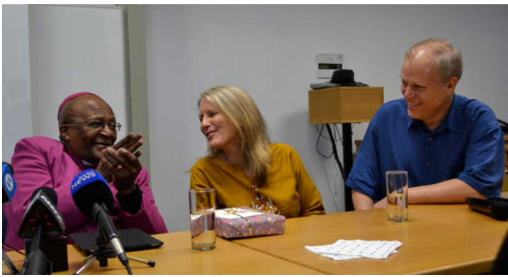
Archbishop Desmond Tutu officially endorsed GERI and its methodology in 2013.